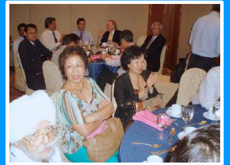
Visitors from IWC Kuala Lumpur