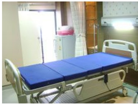
Top – School children (top) in Samut Prakan Province, Thailand. Bottom – Additional beds for the province's main public hospital.