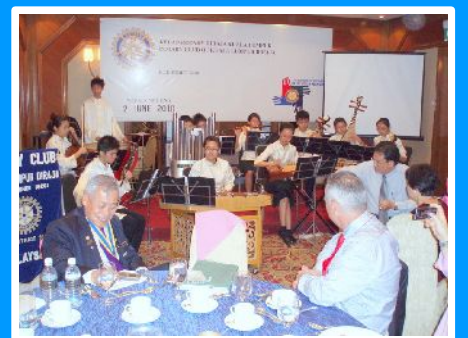
The Sri Jinjang Orchestra performing