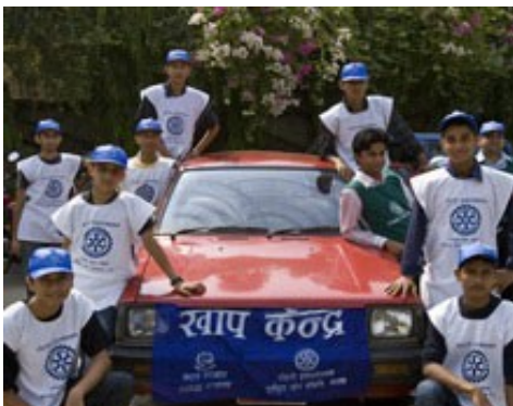
Interactors get ready to take part in a Sub-national Immunization Day in Nepal in 2008.

To help promote the growth of Interact, the RI Board has agreed to lower the age of eligibility for Interactors from 14 to 12.