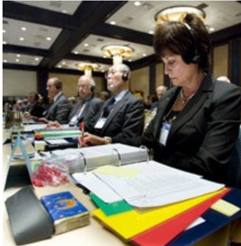
A representative from one of Rotary's 531 Districts looks over proposed legislation during the Council on Legislation 26 April.

Representatives to the 2010 Council on Legislation left Chicago having enacted a number of monumental measures that will make e-clubs a permanent part of Rotary International, create a fifth Avenue of Service for New Generations, increase the annual per capita dues that clubs pay to RI by US$1, and give Rotarians in North America a choice of how they receive The Rotarian .