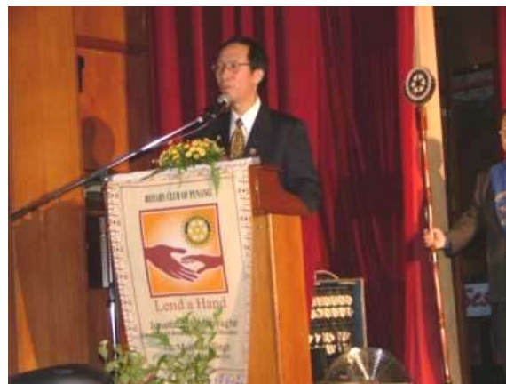
Minister of Penang Tan Sri Dr. Koh Tsu Koon declares the 69th District Assembly open.