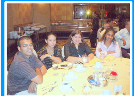
Visitors from RAC Kuala Lumpur