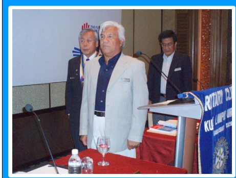
Rtn Adenan, a popular choice for National Anthem and Loyal Toast