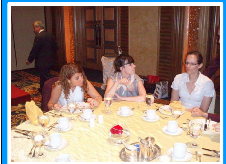
Part of the visiting GSE team