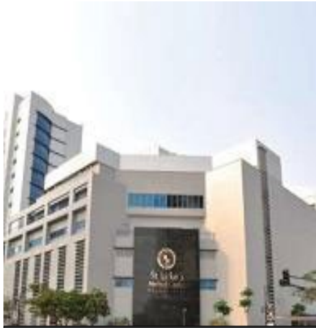
St Luke's Medical Center-Global City

Building on its world-class expertise and to broaden its base as the Philippines' premier hospital group, SLMC decided a few years ago to embark on setting up another hospital in the Bonifacio Global City business district. Planning for this ultra-modern 600-bed hospital took 3 years and construction another 3.1/2 years, using home-grown (Philippines) architects, planners and contractors. Ground breaking was in February 2005 and some 5 years later, SLMC-Global City was officially opened by Philippines president Gloria Macapagal-Arroyo in January this year.