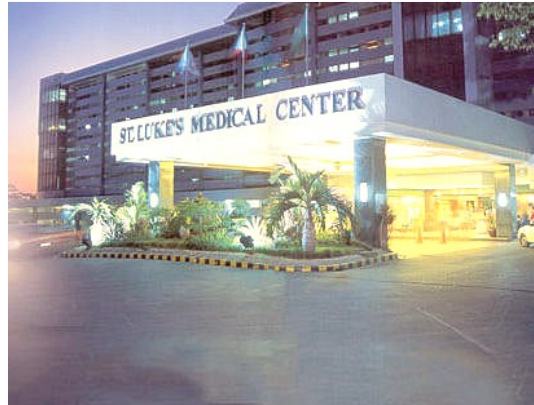
St Luke's Medical Center