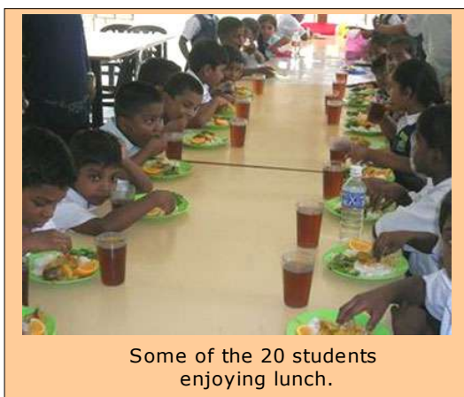
Some of the 20 students enjoying lunch.