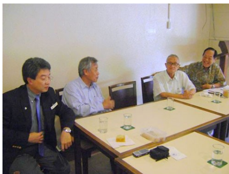
Pres. Rizal and PE Andy at the PROBUS meeting

Perhaps an effort can be made to invite 'our' PROBUS members more often to one of our weekly meetings and fellowship functions including installation dinners.