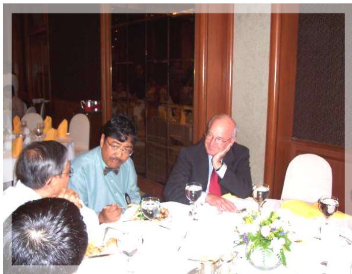
HE deep in conversation.