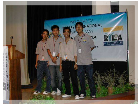
The RYLA participants from Hatyai.

Four students nominated by our sister club, RC Hatyai Nakarin, and sponsored by our club, were in KL recently to attend the D3300 Centennial RYLA held at the impressive Petronas Management Training facilities (PERMATA) in Bandar Baru Bangi. Two of the students are freshmen in accountancy and economics studies respectively at the Thammasart University, Songkhla, and the others are Grade 11 high school students.