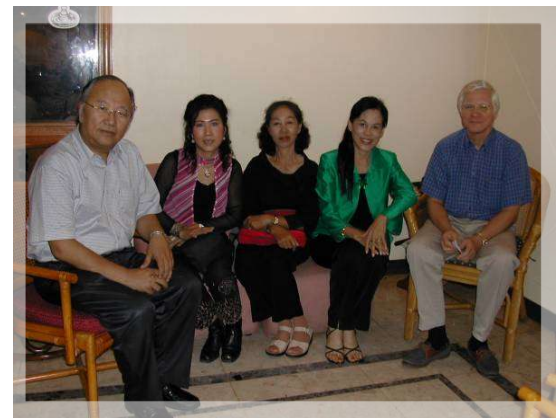
Impromptu sister club meeting.

The four boys arrived by bus in the early hours of Thursday morning, and after having been fleeced by an unscrupulous KL taxi driver for the short ride from Pudu Raya to the YMCA, were taken care of by kind Gombak Rotarians who ensured safe transport to the venue and to whom our club is grateful for this.