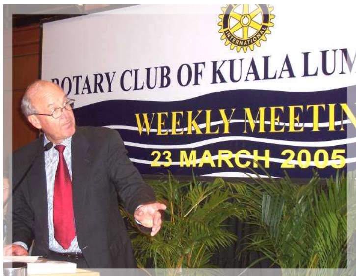
HE giving his talk.