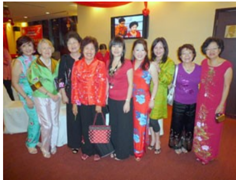
No function is complete without lovely ladies