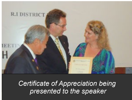
Certificate of Appreciation being presented to the speaker