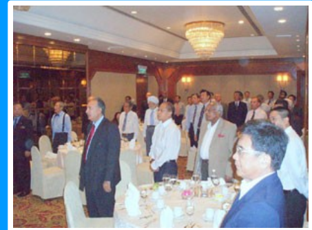
Singing of the Negaraku