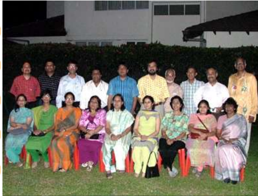
Rotarians and Rotary Anns from District 3060 Gujarat and District 3050 Rajasthan and District 3300 Malaysia at Kelana Jaya enjoying Rotary Friendship Exchange to promote international understanding and goodwill.