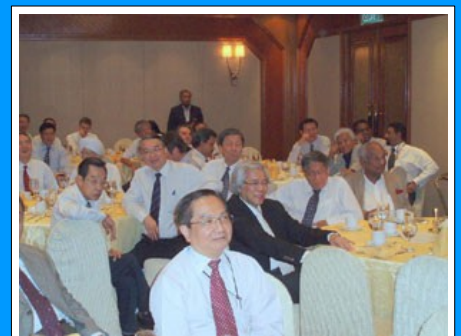
An attentive crowd listening to the speaker