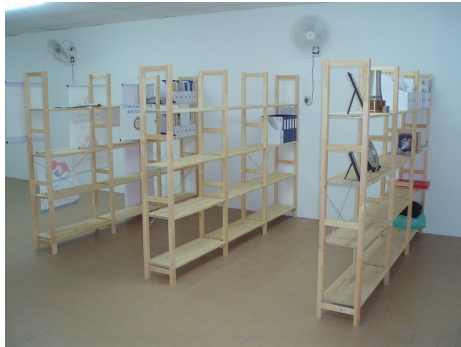
Shelving ready to be filled up

archives, also past Hon. Secretaries, club officer, in fact all Rotarians may be 'sitting' on things connected with Rotary which they (or their spouses) would be glad to remove from their offices, homes, garages or wherever. I have already transferred my small collection of international service and secretarial files (including correspondence).