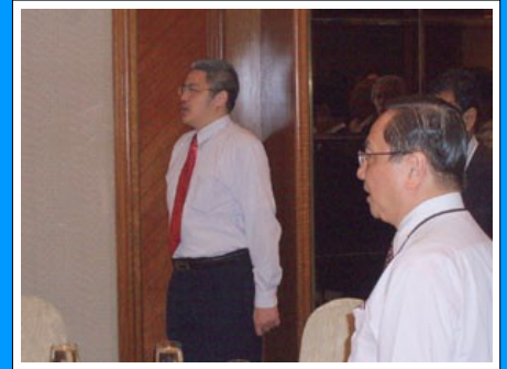
Singing the national anthem with gusto