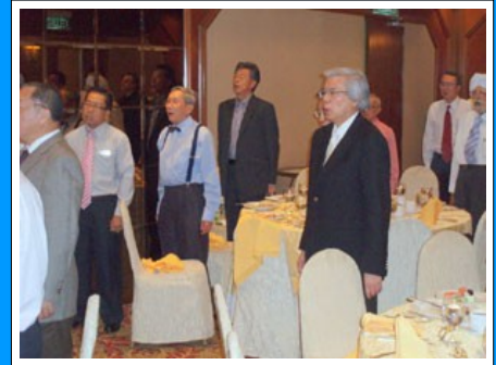
Good to see you again, PP Low Bin Tick