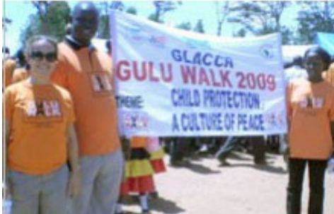
(second from left) takes part in the Gulu Walk 2009, a peace-building campaign focusing on the plight of war-affected children in northern Uganda (Photo courtesy of Robert Opira)

(By Dan Nixon - Rotary International News)