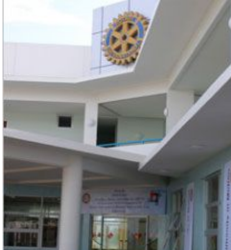
The entrance of the health center.