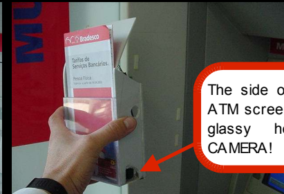
4. Wait, is it really a pamphlet holder?

The side of box ,facing the ATM screen has a reflective glassy hole.... that's a CAMERA!