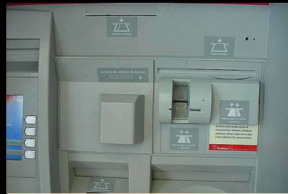
1. ATM machine as usual.