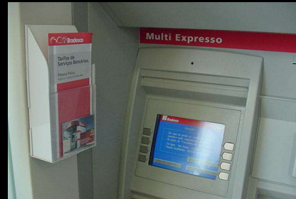
3. A monitor and pamphlet holder at the side, nothing wrong.

FALSE slot Fixed to the original card slot. (Same color and sticker). Contains additional card reader to copy your card information and duplicate your card.