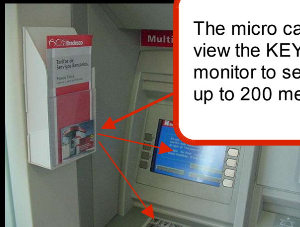
5. False pamphlet box affixed to the ATM cubicle side.

The side of box ,facing the ATM screen has a reflective glassy hole.... that's a CAMERA!