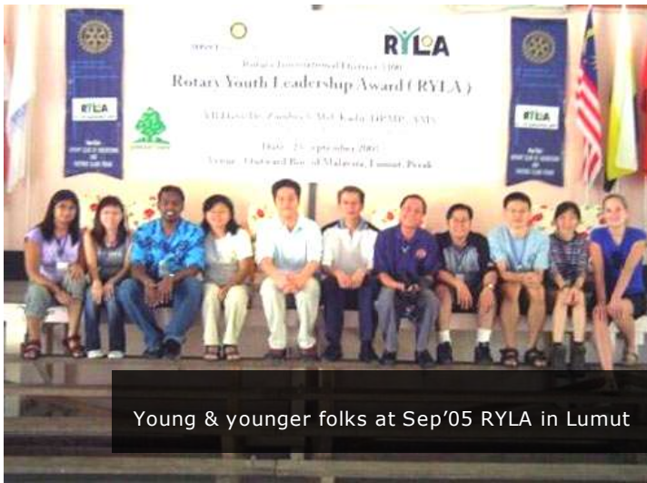
Young & younger folks at Sep'05 RYLA in Lumut