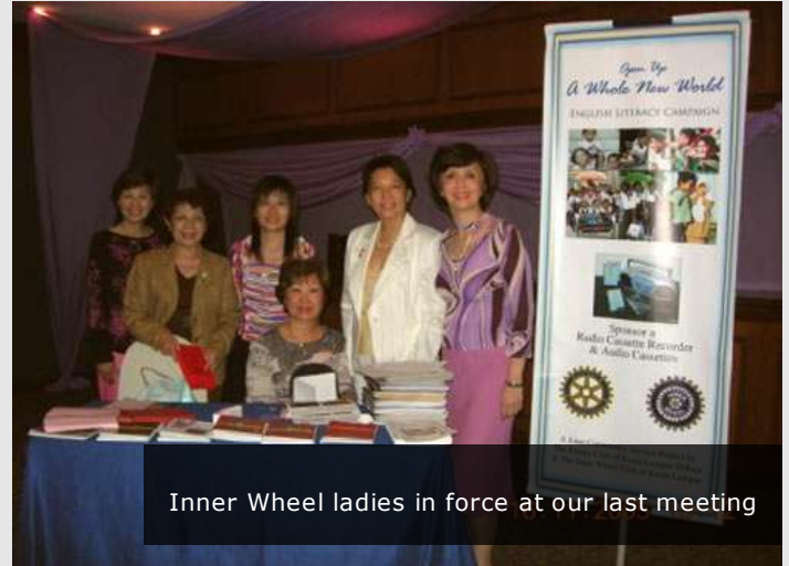
Inner Wheel ladies in force at our last meeting