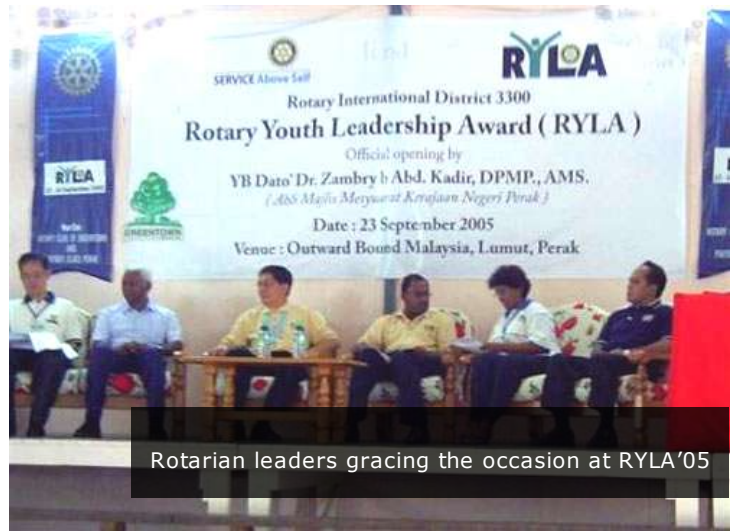
Rotarian leaders gracing the occasion at RYLA'05