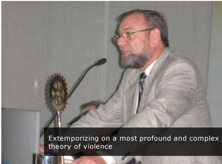
Extemporizing on a most profound and complex theory of violence