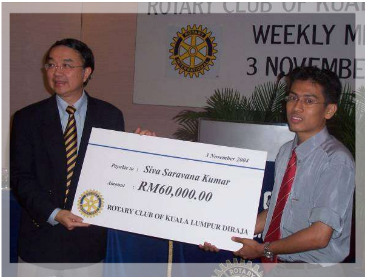
Presentation of mock cheque.