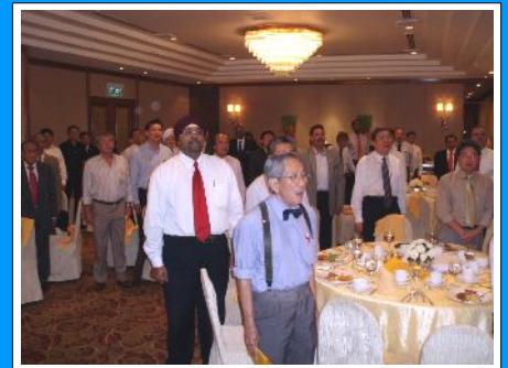
A very enthusiastic PP Low Bin Tick