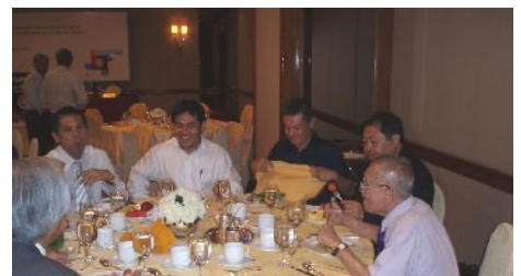
Engaging the Guests