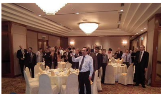
Club Members doing the Loyal Toast.