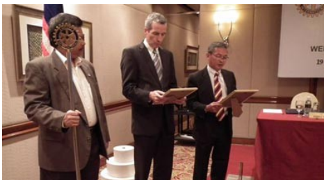
The two inductees is reading aloud the Rotary Pledge.