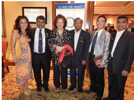
A group photograph with our guests.