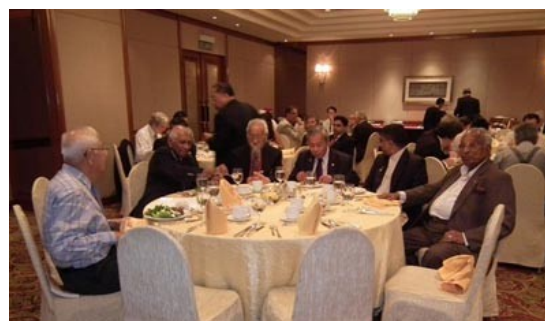
Members and guests enjoying the delicious Buffet Lunch.