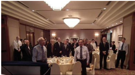
Members stood up to welcome the two new members.