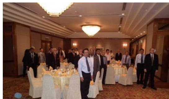
Members singing the National Anthem.