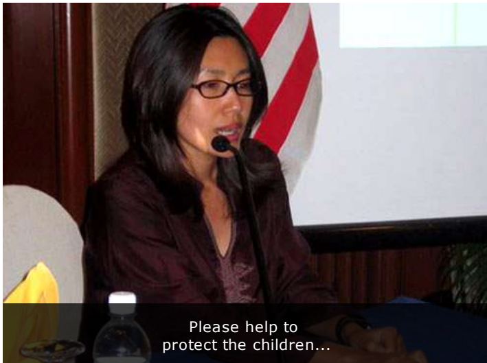
Please help to protect the children...