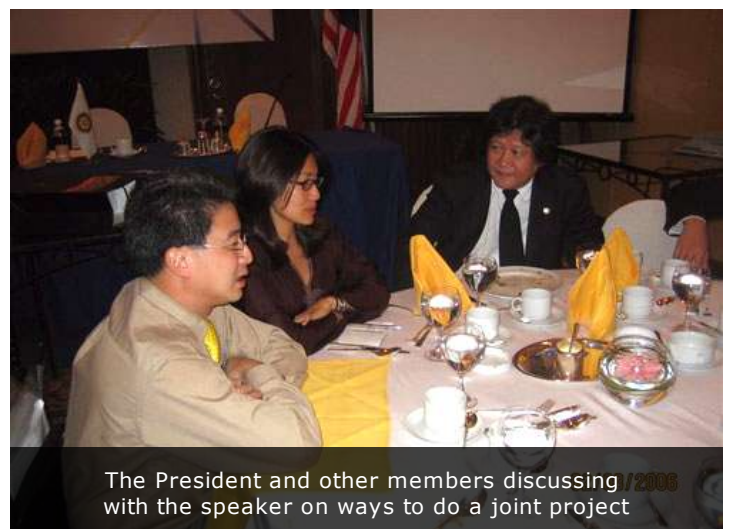
The President and other members discussing with the speaker on ways to do a joint project