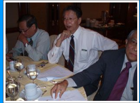
Members listening attentively

PDG Beh Lye Huat suggested that the club engage professional help in properly setting up the club's archive and cataloguing of all material submitted.