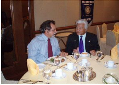
Two new Rotarians exchanging views

The present board may have overlooked this as it is new....but may I take the liberty to suggest that the board do present a budget soon? ...AND that all incoming boards do adopt this good practice in future? 😊