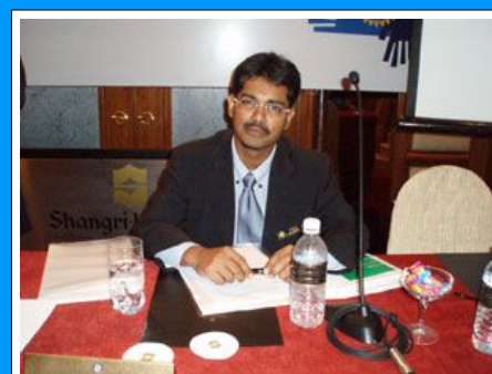
Hon. Sec. Ridza preparing to be lead singer?