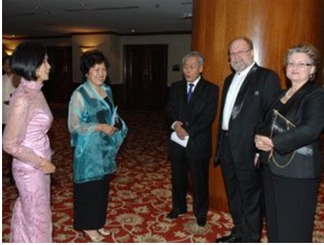
Visitors from RC Bangkok