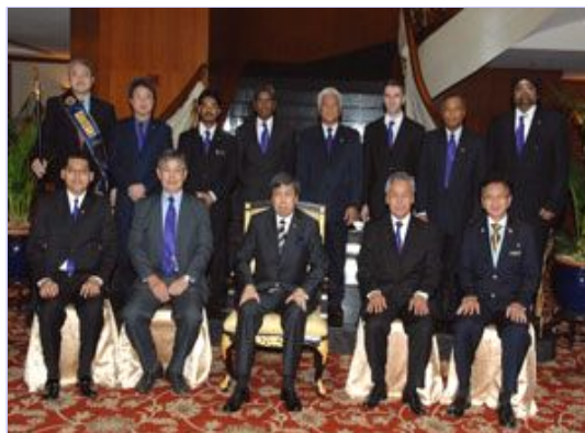
HRH Sultan Selangor and DG Leslie Salehuddin with RCKL board (2009-10)

The final attendance figure and financial information, if available, will be presented to the club members during the forthcoming assembly.