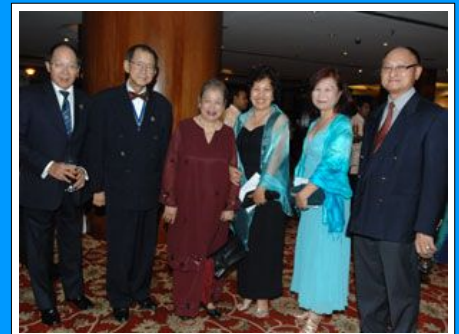
Old friends meet again