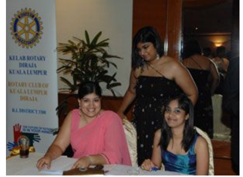
Our very helpful members of Rotaract Club of KL