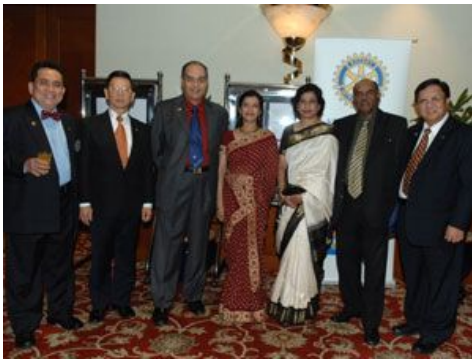
Our friends from RC Raffles City