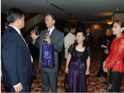
PP Ham renewing friendship with Phuket Rotarians