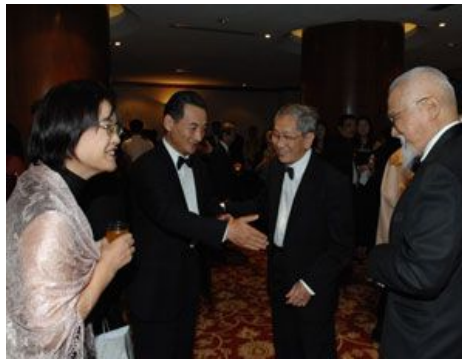
Senior Rotarians mingle with new ones