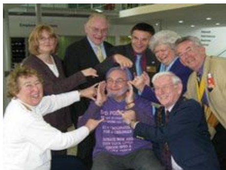
Rotary clubs in District 1240 (England) held fundraisers at schools, supermarkets, and railway stations; painted donors' pinkies; and conducted quiz nights during Purple Pinkie Week, garnering US$28,600 for Rotary's challenge.